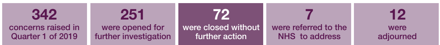
Figure 3: Action following initial assessment Quarter 1 2019 1

During Q1 2019, there were 72 cases that were deemed to not have the necessary information to support any risk to patient safety or damage to public confidence in the dental professions. This means that just over a fifth of all concerns received were considered and closed without further action. 7 cases were referred to the NHS for consideration. There were a further 12 cases adjourned without a decision at the end of Q1.