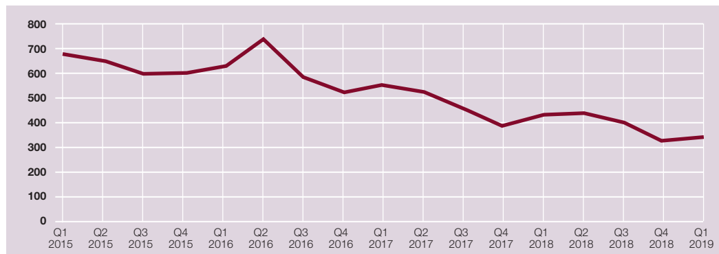
Figure 1: Concerns received by the GDC, by Quarter, 2015 - 2019